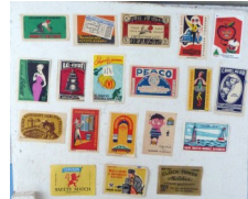
Assembly of Matchbox labels