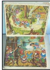
Set of wooden Building Blocks (6- sided pictures). Depicts 'Snow White & The