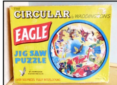
Waddington's Jig-saw Puzzle: Characters appearing in 'Eagle'