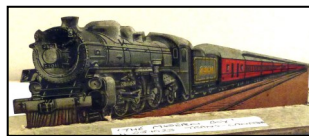
Tinplate miniature stand-up plaque of Canadian railway train