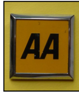
A. A. Motoring Badge. Flat, rectangular