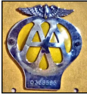
A. A. Motoring Badge Domed