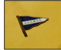
Club Badge: Harwich & Dovercourt Model Yacht Club