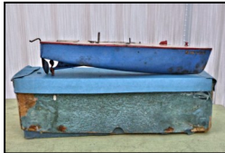
Hornby Speedboat 'Swift'. In distressed original box