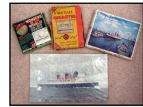
Qty. 4 Jig-saw Puzzles depicting the 1930s-1960s ocean liner