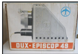
'Dux' Epidioscope image viewer