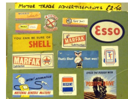
Set of paper advertising signs