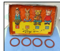
Party game or children's play-set: Hoop-la game

For full descriptions and prices, please refer to main sales pages To order any of the above items send an e-mail to: cliff@maddocktoys.com