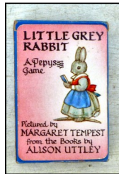
Pepys Card Game: 'Little Grey Rabbit' Complete with instructions.