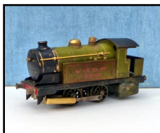
Bowman Model 234 live-steam Tank Locomotive