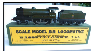
Bassett-Lowke post-war 12v. 3-rail electric Locomotive 'Prince Charles' With a box