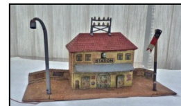
Distler tinplate Station with electric lighting