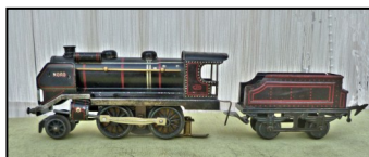
JEP 2-4-0 Tender Locomotive 'NORD'. Low-voltage electric