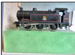
Bassett-Lowke 12v. electric 0-6-0 Tank Locomotive, B.R. black,