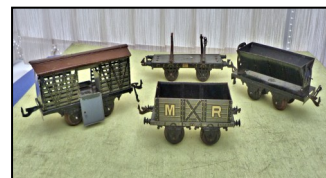
Bing Freight Wagons. Pack of 4