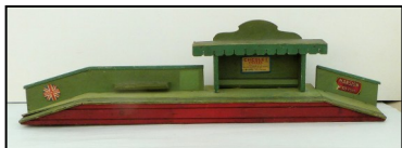
Wooden Wayside Station by 'Giv-joy'.