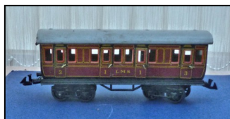
Bing short wheel-base bogie Coach L.M.S.