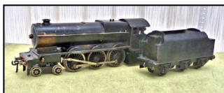
Bassett-Lowke 4-6-0 spirit-fired Tender Locomotive 'Super Enterprise'