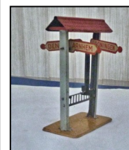
Unidentified (European) Destination Indicator Frame

For full descriptions and prices, please refer to main sales pages To order any of the above items send an e-mail to: cliff@maddocktoys.com