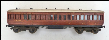
Leeds Model Co. Wooden-bodied Bogie Coach, L.N.E.R. teak, over-varnished